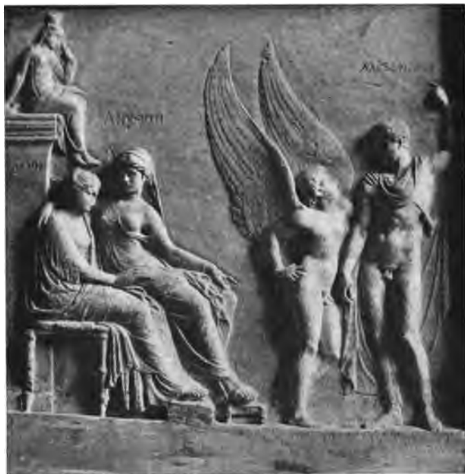
• • Fig. 88. The persuasion of Helen.

daughters, Athena and Aphrodite, but it was the first cause of the war between Greeks and Trojans, which, after lasting for ten years, ended in the utter destruction of Troy and the death